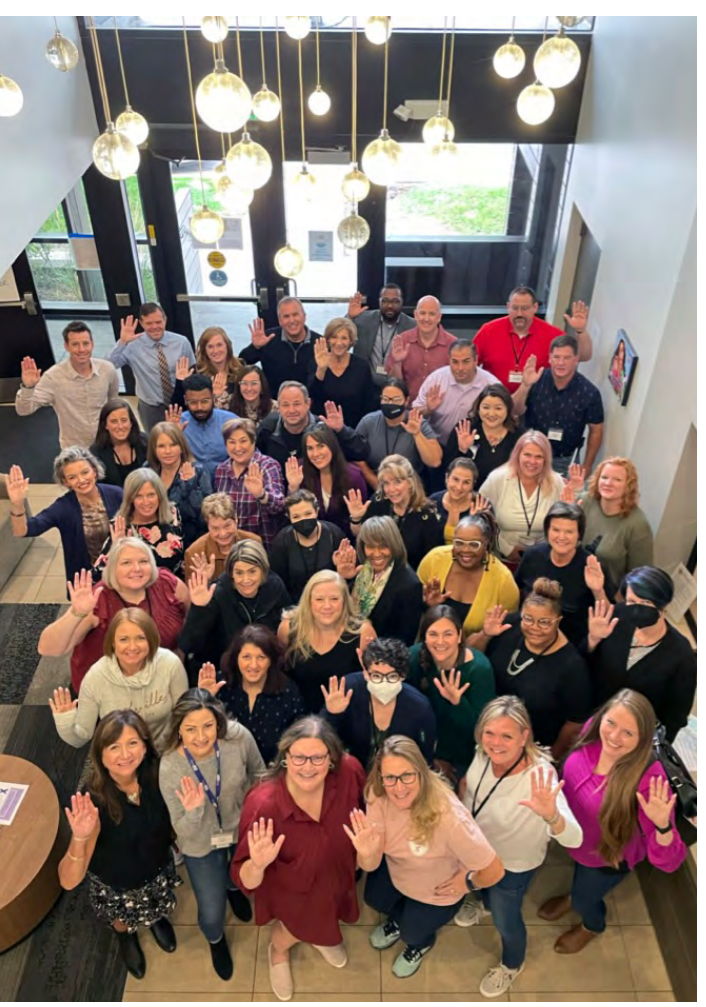
LEADERSHIP SUMMIT AT ROSE ANDOM CENTER, DENVER, CO

The second two days of the retreat were held at the Rose Andom Center in downtown Denver. The second two days were available to all Family Justice Centers and leaders from organizations interested in expanding their multidisciplinary partnership and included tours of both the Rose Andom Center and Porchlight Family Justice Center in Lakewood, Colorado.