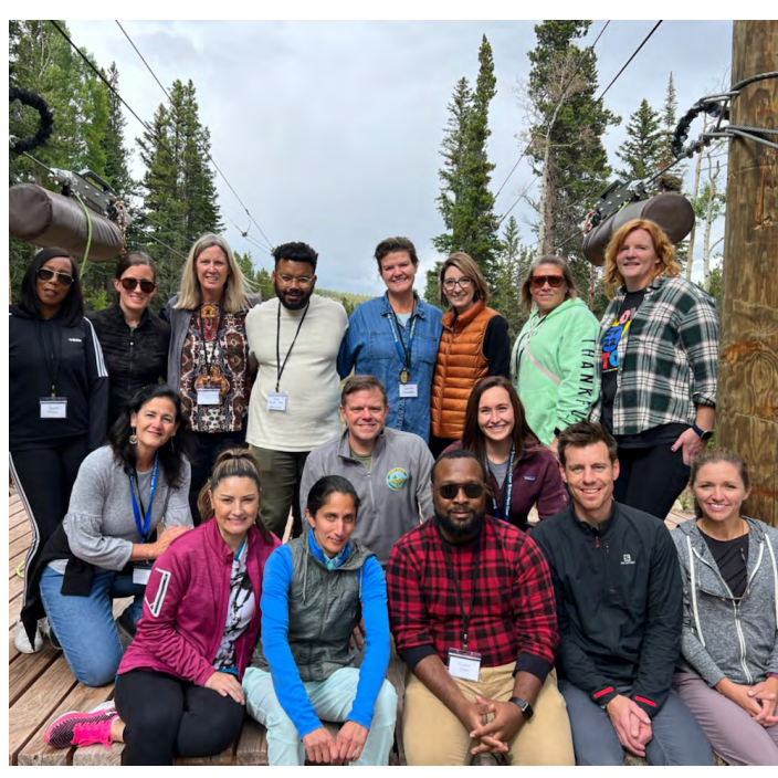
DIRECTORS' RETREAT AT HIGH PEAK CAMP, ESTES PARK, CO

The 13<sup>th</sup> Annual Leadership Summit of the Family Justice Center Alliance was the most unique leadership event ever hosted by Alliance for HOPE International. The first part of the event was held at High Peak Camp in Estes Park, Colorado specifically for Affiliated Family Justice Center Directors. The two days at High Peak Camp also allowed the Directors to experience the Alliance's new retreat Center just down the road in Allenspark, Colorado – H7 at Hope Mountain. H7 is now available to all Affiliated Family Justice Centers and Camp HOPE America programs for leadership retreats, Board retreats, and team building events (Email the Alliance at: <a href="info@allianceforhope.com">info@allianceforhope.com</a> for more information).